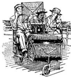
The Loop That Solves So Many Radio Problems Warren Radio Loop

THIS MEANS YOU SLEEP SOUNDLY, WAKE REFRESHED, AND HAVE EXTRA ENERGY ALL DAY.